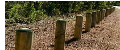
Ornamental bollards / timber bollards or hoops Along the left to separate cars and pedestrians could be removable. Consider bollards/post/hoops to match opposite entrance side (right) to deter parking on the right & protect the dwelling. Rugby based organisation are local such as https://www.autopa.co.uk/

Grassmats Home - Grassmats Ltd https://grassmats.co.uk/ https://www.ultimate-one.co.uk/grass-reinforcement-and-ground-protection-grass-car-parking-c-103_147 Or Grass Grids - Grass Parking & Driveway Solutions | EcoGrid