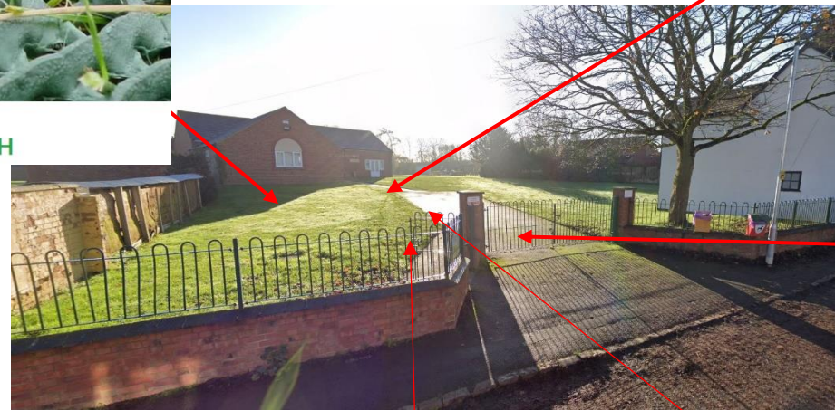
Pair of fold down parking posts or automatic/telescopic parking posts inside the gates near the entrance.