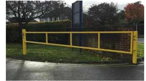
Option swing gate inside entrance option for parking