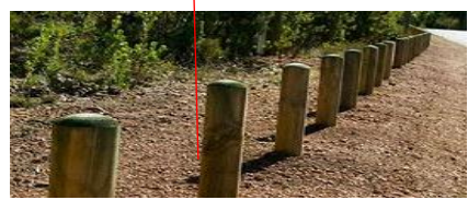
Ornamental bollards / timber bollards or hoops Along the left to separate cars and pedestrians could be removable. Consider bollards/post/hoops to match opposite entrance side (right) to deter parking on the right & protect the dwelling. Rugby based organisation are local such as https://www.autopa.co.uk/

Grassmats Home - Grassmats Ltd https://grassmats.co.uk/ https://www.ultimate-one.co.uk/grass-reinforcement-and-ground-protection-grass-car-parking-c-103_147 Or Grass Grids - Grass Parking & Driveway Solutions | EcoGrid