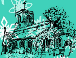
St Helen's Sibbertoft