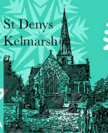
St Denys Kelmarsh