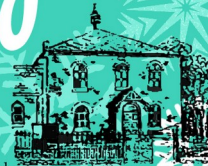
Welford Congregational Chapel

... We came here to shape it Barak Obama