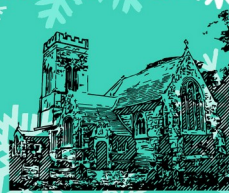
St Michael's Haselbech