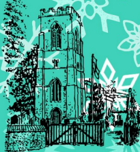
St Mary The Virgin, Welford