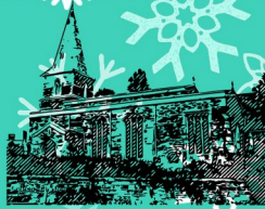
All Saints, Clipston