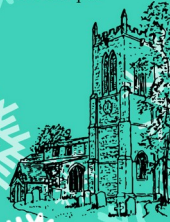
St Nicholas Marston Trussell